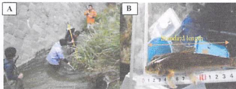
Figure 2: Fish sampling. (A) netting fish after they had been shocked; (B) weighing and measuring the length of fish.

To evaluate the health of the fish assemblage in the river, we calculated values of 14 fish metrics: (1) native species, (2) endangered species, (3) freshwater species, (4) diadromous species, (5) swimming species, (6) bottom-dwelling species, (7) species that live usually in flow areas, (8) species that live usually in calm areas, (9) mainstream species, (10) floodplain species, (11) species that spawn in aquatic vegetation, (12) species that spawn on muddy bottoms, (13) species that spawn on gravel bottoms, and (14) species that spawn on rocky bottoms. These metrics are typically evaluated with