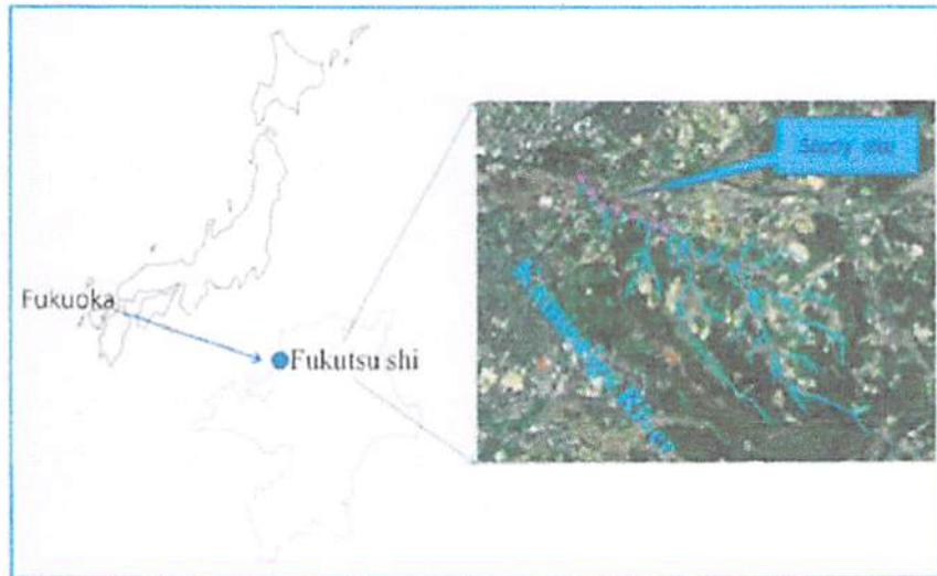
Figure 1: Study site: Kamisaigo River, Fukuoka, Japan.

The second-order Kamisaigo River, in Fukutsu, Fukuoka Prefecture, Japan ( 33^{\circ}45'24.29'' to 33^{\circ}45'40.16'' N, 130^{\circ}29'55.52'' to 130^{\circ}29'25.15'' E; Fig. 1) has a water surface width of 2.4 to 6.8 m and depths ranging from 11 to 30 cm. The study area was an 800-m reach located at the confluence with the Saigo River. The primary use of this river is irrigation, and the majority of surrounding land is dedicated to residential and commercial uses. The river has been canalized and lined with concrete; this action has damaged the physical and biological functions of the river.