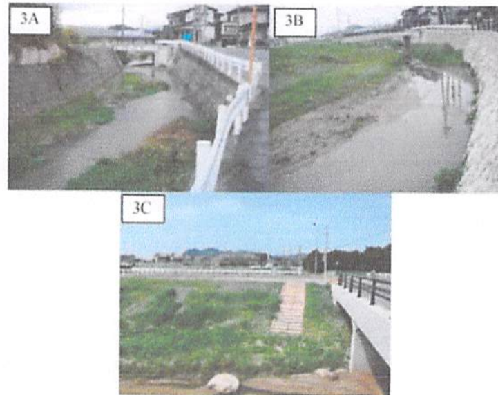
Figure 7: Station 3 condition. (A) Before restoration: concrete banks isolate the movement of organisms. (B, C) Three months after restoration: floodplain restored.