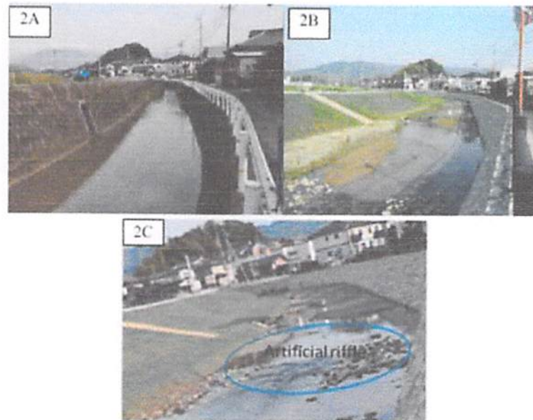
Figure 6: Station 2 condition. (A) Before restoration: a straight river lined with concrete. (B) Improvement of hydro-morphological status by re-meandering of the river and improvement of the river banks. (C) Two months after restoration; installation of artificial riffle.