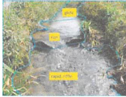
Figure 3: Flow ecological mapping.

respect to criteria such as the environmental significance of the site and data availability. The fish species are listed and scored against criteria developed from high-quality historical data. To verify sampling efficacy, we compared our species list with lists developed by Kyushu University and, where available, those from previous fish collections.