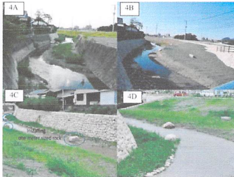
Figure 8: Station 4 condition. (A) Before restoration: the banks were lined by concrete. (B) Two months after restoration: revetments removed and river width doubled. (C) Installation of 1-m boulders. (D) Moderate bank slope.